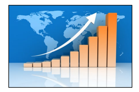
Take the "SASI Pledge" and increase Site income while you prepare for accreditation