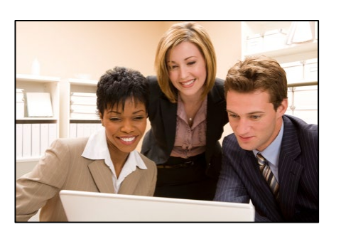
"Test-drive" accreditation with expert guidance and identify quality gaps